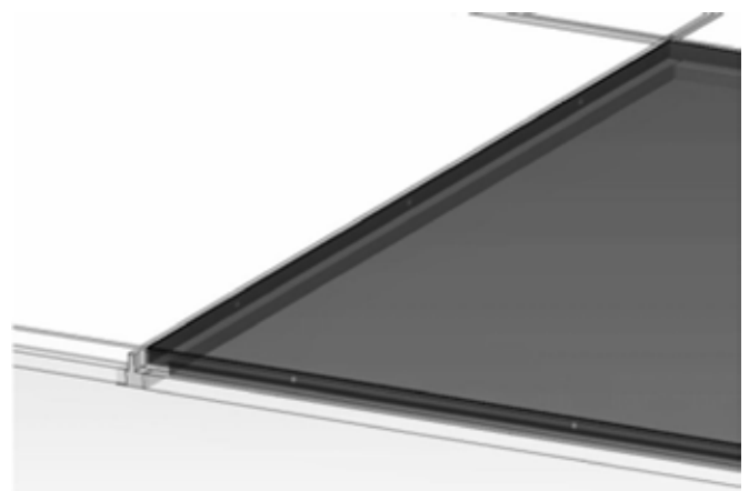
HEATING PANEL INSTALLED ON THE METALIC FRAME OF THE CEILING